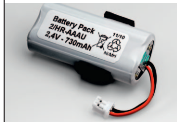
Long life battery for extended operation