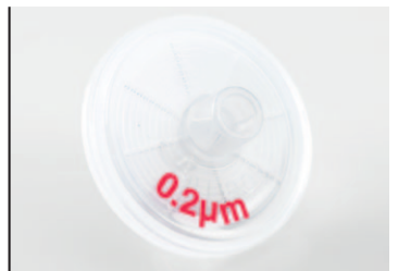
0.2 micron disc filter protects from contamination